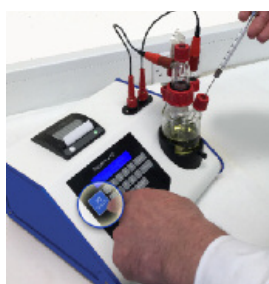
Water check button and syringe

The \mu\text{g} check button allows the operator to simply press go, inject 1 \mu\text{l} or maybe 10 \mu\text{l} of distilled water (as required by some ASTM methods) and verify if the instrument and reagent are working with in their required specification. The \mu\text{g} check overrides the programmed calculation and displays/prints out a report of the verification check. The coulometer then automatically reverts back to the pre-programmed setting.