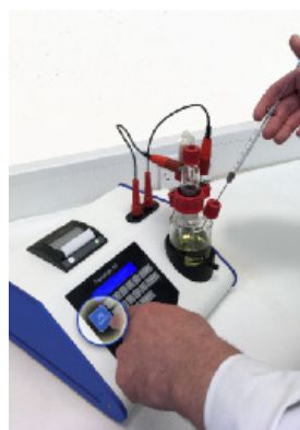
Water check button and syringe

The versatile Aquamax KF Plus is suitable for a wide range of applications and offers many advantages including a tough measuring vessel, a 'press go' keypad and built-in printer.